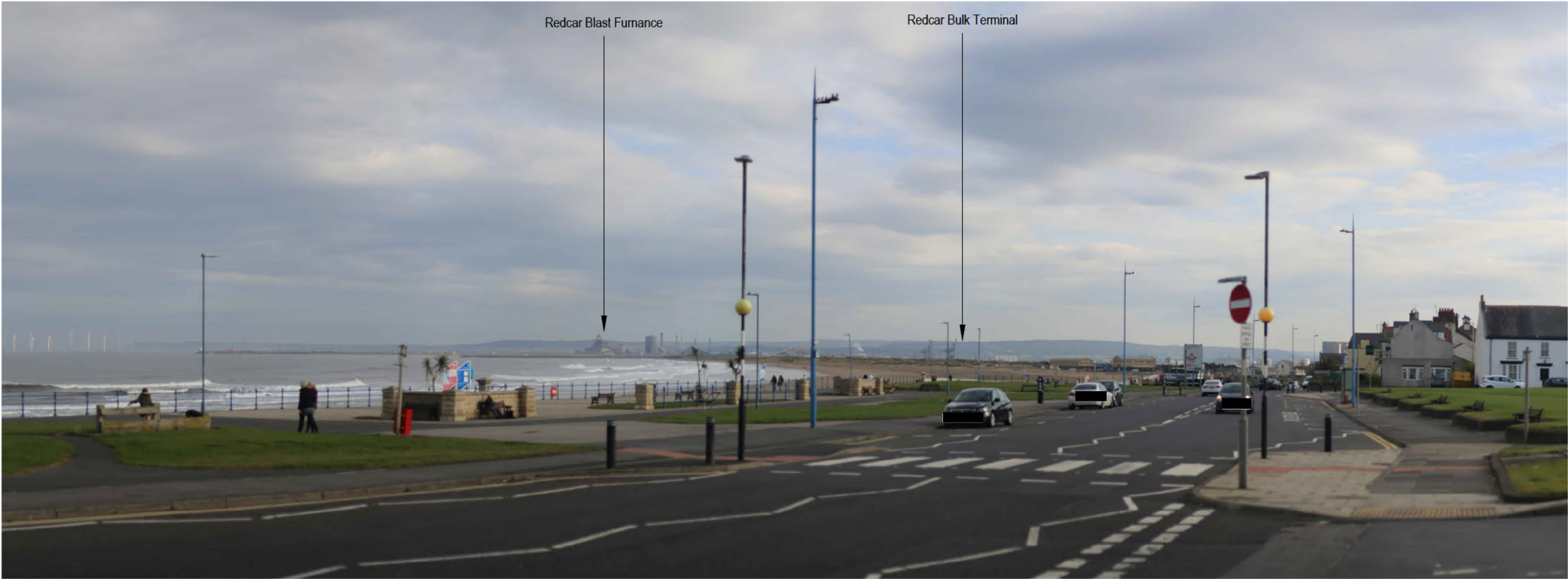
Extent of 50mm single frame image

PROJECT Net Zero Teesside CLIENT NZT Power and NZNS Storage